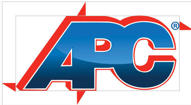
MINIMUM CLEAR SPACE

To ensure the APC Auto Parts Centres logo maintains its visual integrity, a minimum clear space is required around the logo in all applications. The clear space for the logo is defined by the height of the triangle in the letter “A” within the logo.