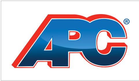
[ Full Colour Logo ]

The APC Auto Parts Centres logo should be used in its full colour version whenever possible. This logo, or other acceptable forms of it, should be used on marketing material, digital and print content, merchandise, brochures, billboards, cars, etc.