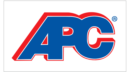
[ Embroidery Logo ]