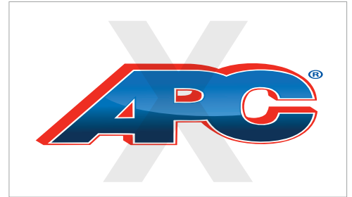
DO NOT STRETCH