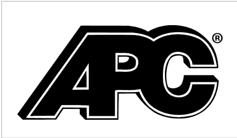
[ Single Colour Logo ]