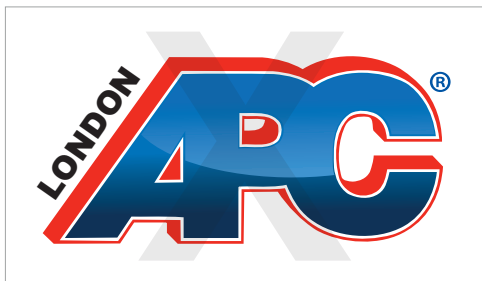
DO NOT ADD TEXT