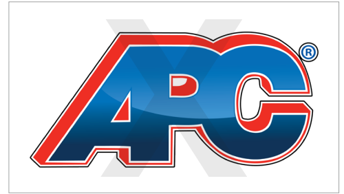
DO NOT ADD STROKE