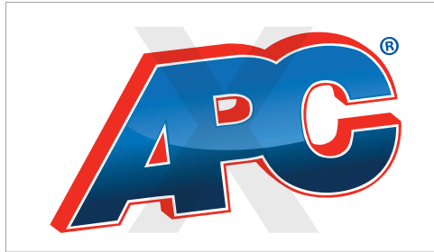
DO NOT ROTATE