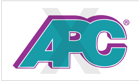
DO NOT CHANGE COLOUR

To ensure proper brand identity, the APC Auto Parts Centres logo must be used in its proper form at all times. The logo must maintain proper proportions at all times and remain proper colours, as well as adhere to other proper uses.