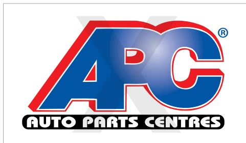
DO NOT USE OLD LOGO VERSIONS