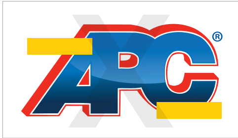
DO NOT INVADE SPACE