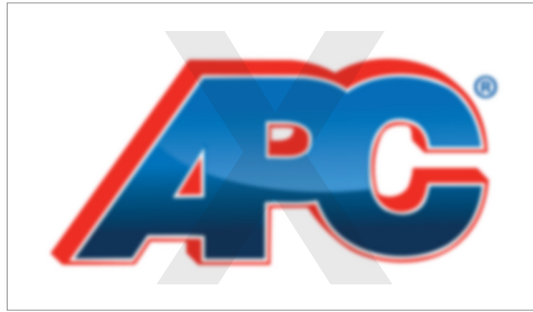
DO NOT BLUR