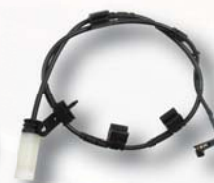
Mini Cooper PWS183